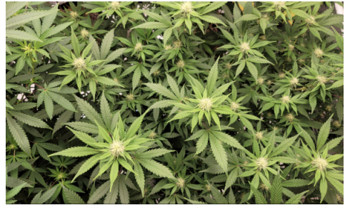
How U.S. Bullying In The 1990s Led To The Olympics Marijuana Ban Behind Richardson's Suspension