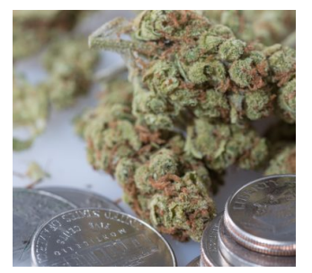
10 Senators Demand That Businesses Be Allowed To Federal SBA Loans