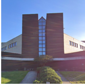
Sexual abuse survivors group asks San Antonio archbishop to add 12 names to list of accused predators Jun 24, 2021