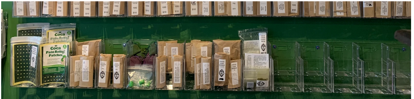
SOME ITEMS FOR SALE AT THE COCA LEAF CAFE & MUSHROOM DISPENSARY.

The shroom boom is taking place online too, with Instagram-based dispensaries marketing microdoses at people seeking mental clarity or anxiety relief. All of this comes at a time when research into psychedelics is becoming more mainstream, jurisdictions such as Oregon and the District of Columbia are legalizing and decriminalizing shrooms, and Big Weed investors are sinking capital into medical psilocybin companies .