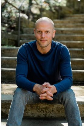
Author Tim Ferriss.

“As the field of psychedelics explodes, we’re going to need sophisticated journalism to provide the public with reliable information and the field with accountability,” said Pollan, whose book, “How to Change Your Mind,” explored the resurging science of psychedelics. “The Ferriss Fellowship will help the Graduate School of Journalism to support young journalists working in this area, which in turn will hasten the establishment of psychedelics as an important and vibrant journalistic beat.”