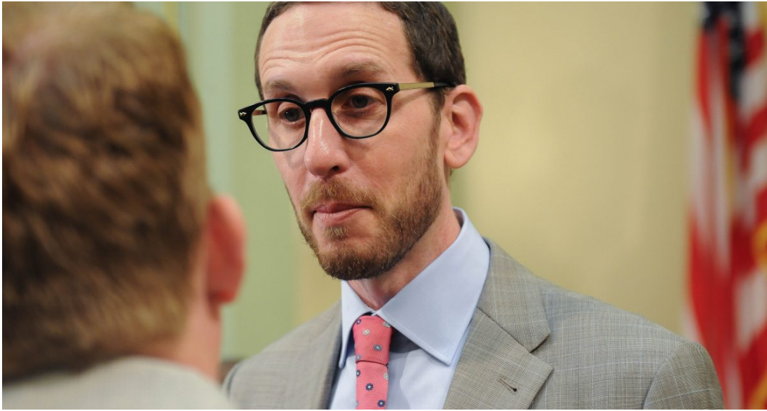
Senator Scott D. Wiener.

Home > Articles > Senator Wiener To Push Again For Decriminalization Of Possession Of Psychedelic Drugs