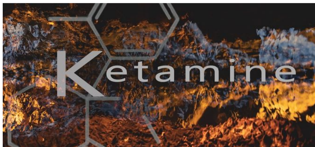
The deal with KHC Capital Group LLC, or Ketamine Health Centers, gives Irwin five ketamine treatment clinics in Florida and an additional partnership contract with two affiliate clinics in Mexico

The company called the deal the next step in the execution of its ketamine clinic roll-up strategy, telling shareholders that the move is part of its plan to become the world's largest chain of psychedelic mental health clinics