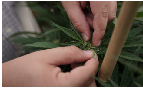
California Awards $1.7 Million In