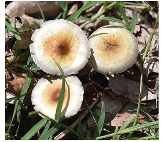
DEA May Find Itself In Fec