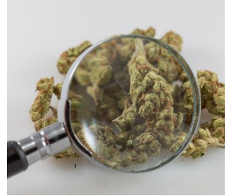
California Seeks To Stand Marijuana Testing To Prevent 'Laboratory Shopping'