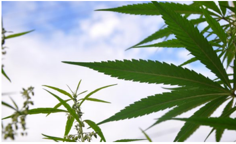
North Dakota Activists Officially Turn