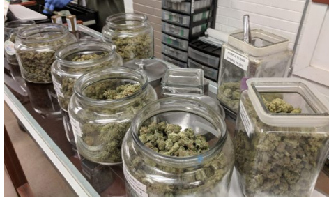
North Dakota Activists Set To Turn In More Than Enough Signatures For Marijuana Legalization Ballot Initiative. Campaign Savs