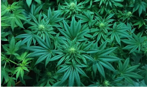
WH says Griner still 'wrongfully detained' despite cannabis guilty plea (Newsletter: July 11, 2022)